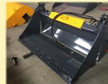
4 IN 1 Bucket